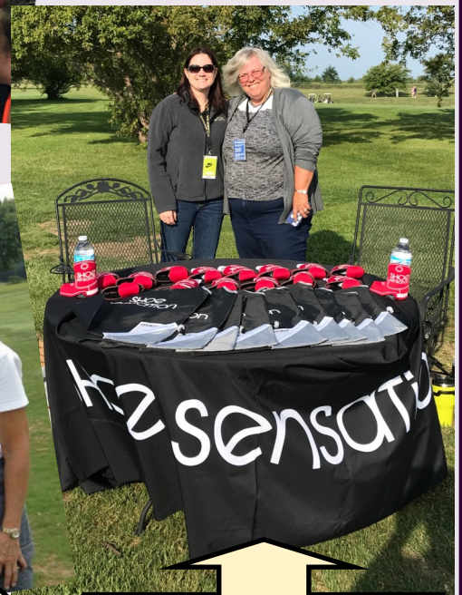
Shoe Sensation sponsored a hole.