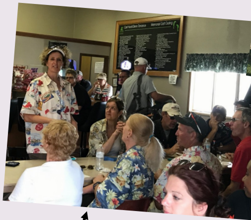
The Moore family