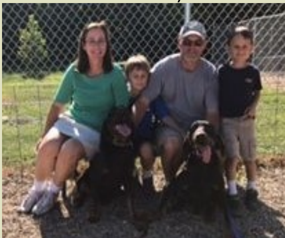
Bam Bam and Bandit with their new family