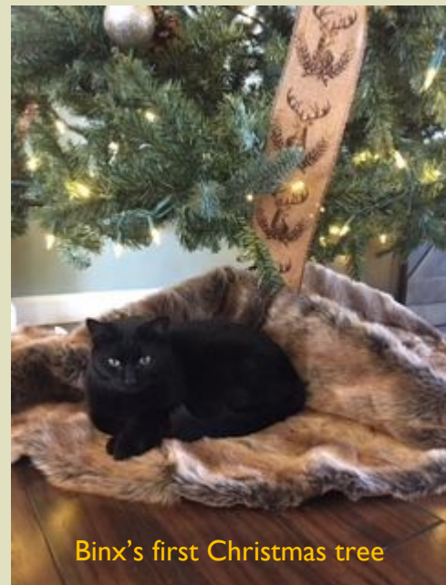
Binx's first Christmas tree