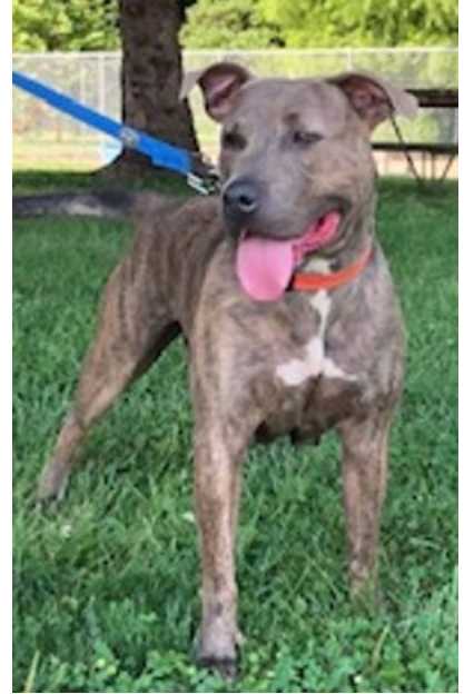
Thunder hoping for her new best friend.

Thunder is the amazing mom of the six pups who were born at the shelter. She is a sweet girl who loves attention, long walks, playing ball and being able to be herself again now that she has weaned her pups and they have all found homes. She keeps her kennel very clean and likes the company of male dogs once she has had the opportunity to get acquainted. Thunder is a smart girl who will make a great companion. And, she has regained her girlish figure!