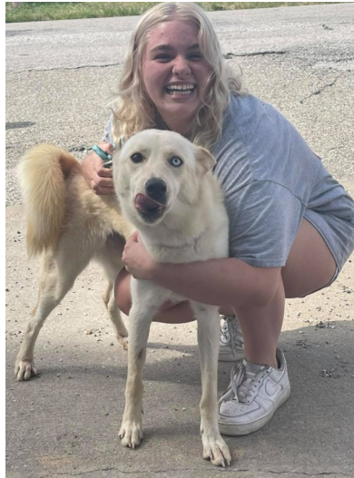
Jazzy going to her forever home