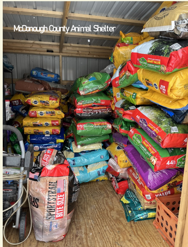
McDonough County Animal Shelter

It takes a village to care for the needy animals. The Shelter was down to one bag of food and they put out a call for help. Our wonderful community responded.