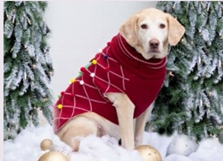
This year, photos were taken on the Courthouse lawn.

Captured Moments Photography and the HSMC again participated in Dickens on the Square. Stacie Kwacala volunteered her photography services to take holiday photos.