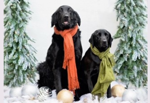
These beauties have come every year since they were puppies!