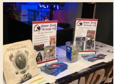
The HSMC table and nearly full donation pitcher