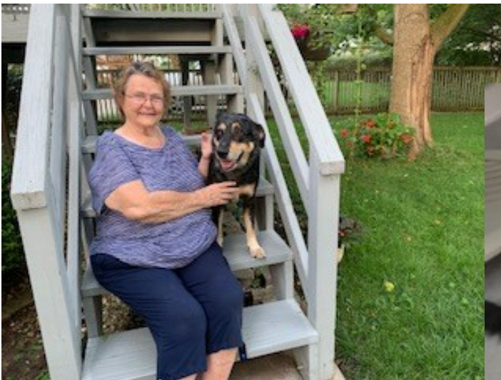
Casey (Bandit) at home