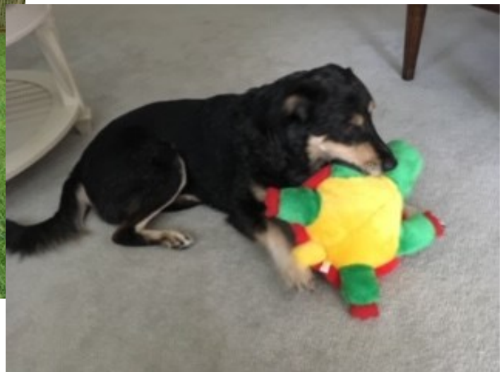
Casey (Bandit) with toy