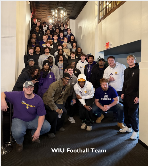
WIU Football Team

The 4th annual Casino Night raised over $50,000! After expenses, over $40,000 was put into the HSMC New Animal Shelter Building Campaign! Thank you to our volunteer dealers, volunteer Krista Skien Photography for the wonderful photos, our Casino Night Sponsors for their generous support, the WIU Football team for their exceptional help in unloading and loading equipment in record time, the animal shelter staff for bringing the dogs, attendees who purchased tickets, and the Casino Night committee for their hard work! Thank you!!!